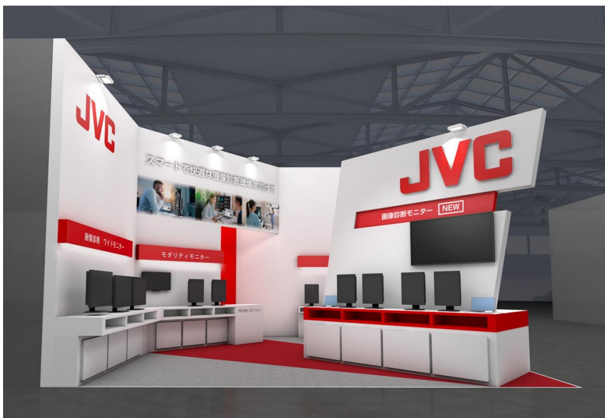
Conceptual image of JVCKENWOOD booth

Under the theme of “Toward a Smart and Comfortable Diagnostic Imaging Environment,” the JVCKENWOOD booth will feature a full lineup of medical image display monitors, mainly the “i3 Series,” and introduce software and services that can be linked to its display monitor products.