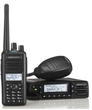
Professional digital radio systems delivered to the National Police of Ukraine