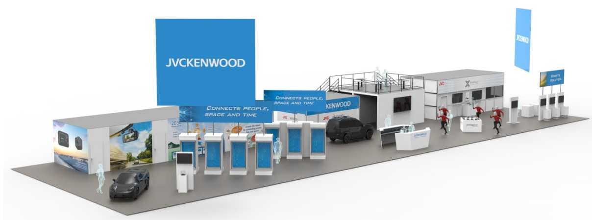
Conceptual image of JVCKENWOOD booth

From our new product lines, our car electronics exhibits will highlight car AV products which support wireless connections to Wireless CarPlay and Android Auto Wireless. Our AV exhibits will feature IP video production solutions, centering on CONNECTED CAM STUDIO live production suits, that support a wide range of video production workflows from shooting to broadcasting and streaming. We will also showcase solutions for the sports field, such as by holding a trial listening demonstration of new products from the AE series of Bluetooth® sports headphones.