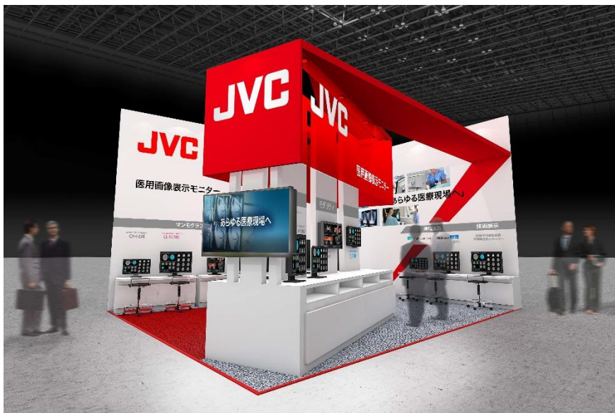
Conceptual image of JVCKENWOOD booth

The JVCKENWOOD booth's lineup of medical image displays will include the high-end i3 series, which has been well received for its various functionality supporting image interpretation and anti-bacterial measures, and the first appearance of the 32-inch, 8-million-pixel wide model CL-R813 (a new product announced on March 23), which achieves both cost performance and practicality. We will also be proposing a monitor quality management cloud service for clinics and remote image interpretation, and technology related to a new image interpretation style that combines a gaze tracking system with an image interpretation monitor.